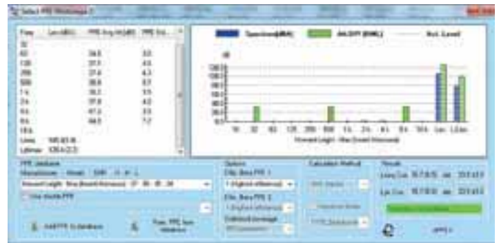
Noise Studio: NS1 “Workers Protection” module; PPE effectiveness analysis.

This application module analyses noise and vibrations in the workplace according to the European directives 2003/10/EC, 2002/44/EC, UNI 9432/2011 and ISO 9612/2011. Sound level measurements and vibration measurements in workplaces are organized in a project where they can be handled and analysed according to standards requirements. The company information, the list of workers and the noise or vibration sources are organized in a database. In addition to calculating the noise exposure of workers the program allows to evaluate the effectiveness of personal protective equipment (PPE) using the SNR, HML and OBM methods (the method applied depends on the presence or not of octave band spectrum on the sound level meter performances). According to UNI 9432/2011, the program also calculates the impulsiveness index of a noise source. The software creates complete reports both for individual worker and synthetic including the company exposition summary. Reports can be exported or printed directly.